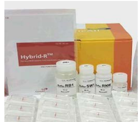
Hybrid -R RNA Isolation Kit ( 305-101)